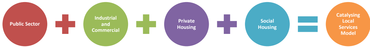
Figure 1: Blaenau Gwent Energy Catalyst Model – Proposed Energy Platforms

2.4. The breadth of the local energy system in Blaenau Gwent is very wide, so we sought to break down the energy system into groups or categories. We identified four initial categories of buildings across Blaenau Gwent that would be required to form part of a local energy services model. Figure 1 shows details of the four platforms identified.